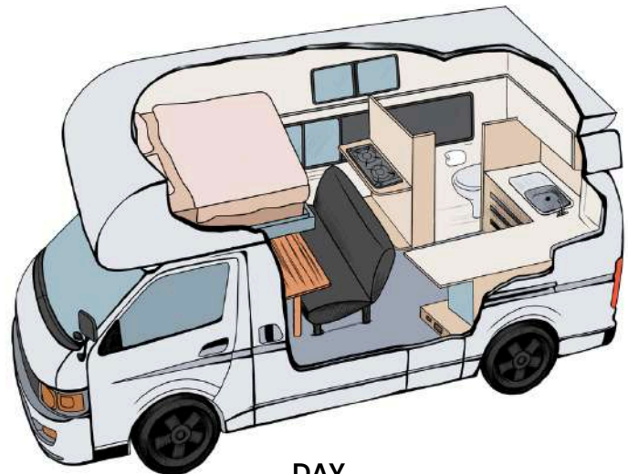
DAY (And Night for 2 people)