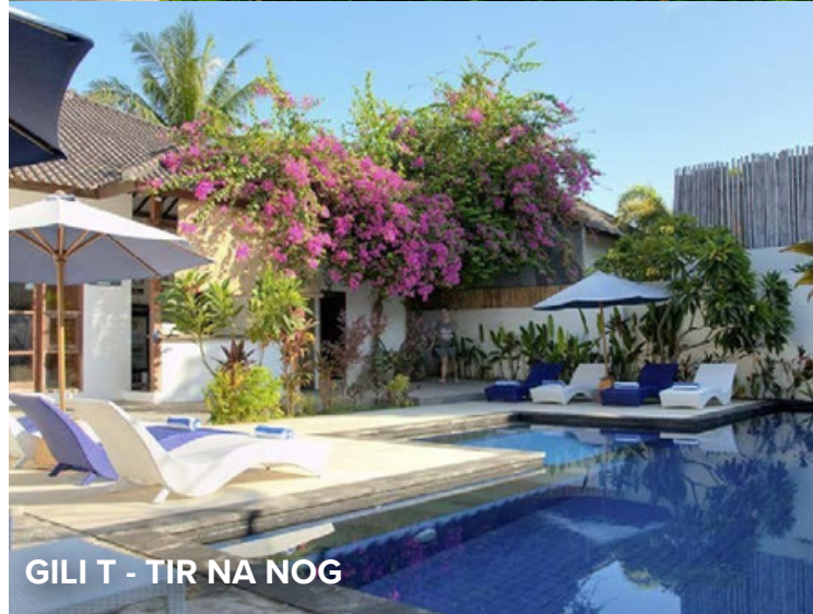
GILI T - TIR NA NOG