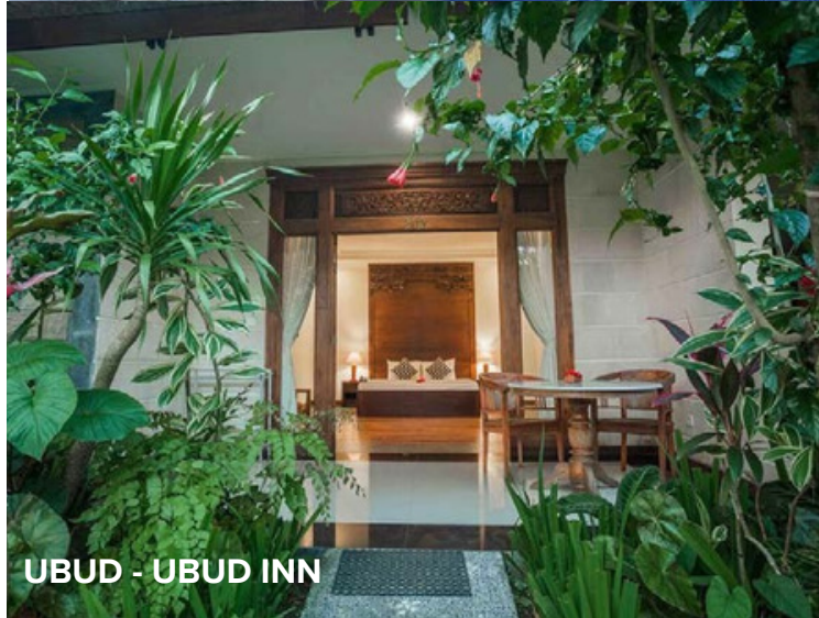
UBUD - UBUD INN