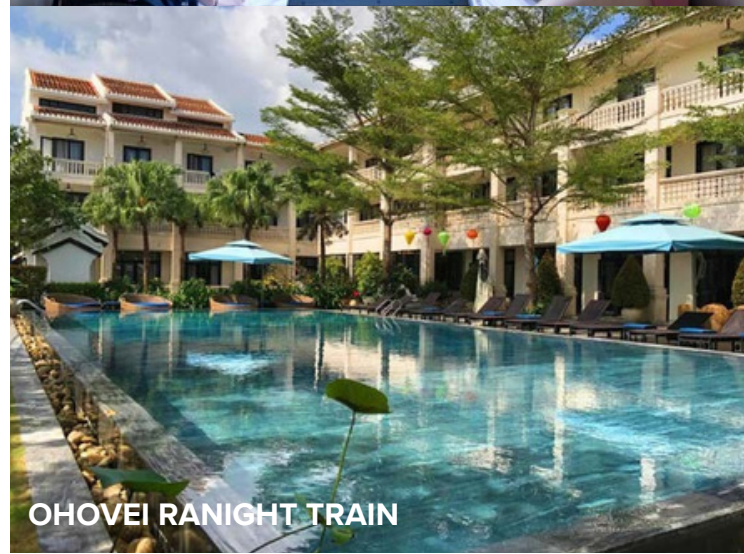
OHOVEI RANIGHT TRAIN